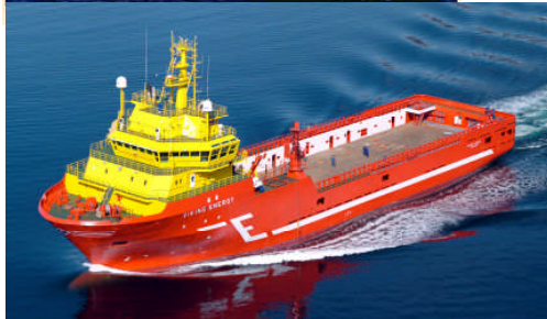
Two Supply Vessels 2003 and one in 2008 Two new supply vessels on order