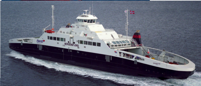
Series of five LNG car ferries 2007 13 new ferries on order or to be designed