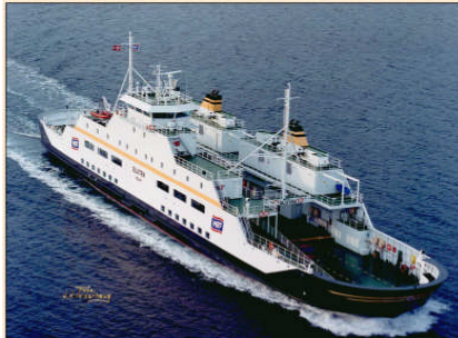
The first LNG ferry Glutra 2000